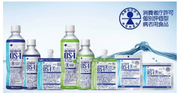
Oral Rehydration Solution OS-1 ® series

OS-1 Jelly Apple Flavor is a product with the same concentrations of ingredients involved in the water and electrolyte replenishment effect as the oral rehydration solution OS-1. Apple flavoring is used to change the flavor, and as with OS-1, it has been approved by the Consumer Affairs Agency for labeling as an individually evaluated food for persons with medical conditions, categorized as a food for special dietary use.