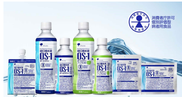
Oral Rehydration Solution OS-1 ® series

OS-1 Apple Flavor is a product with the same concentrations of ingredients involved in the water and electrolyte replenishment effect as the oral rehydration solution OS-1. Apple flavoring is used to change the flavor, and as with OS-1, it has been approved by the Consumer Affairs Agency for labeling as an individually evaluated food for persons with medical conditions, categorized as a food for special dietary use. We hope that this product will be a new option for users.